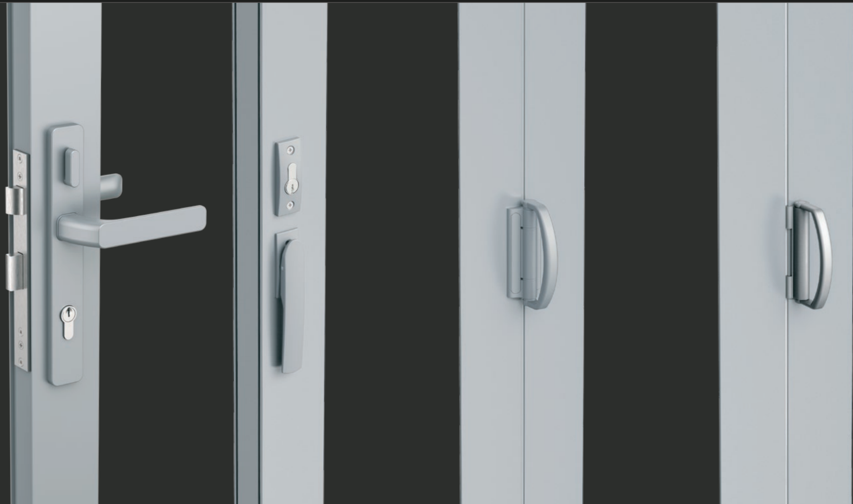
Commercial pull handle